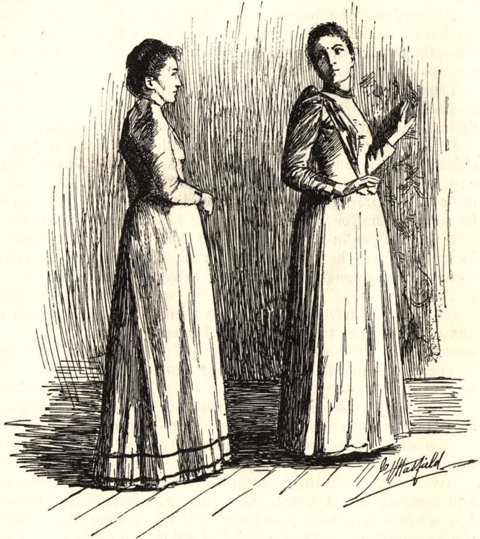
"She didn't know I was in the Room."