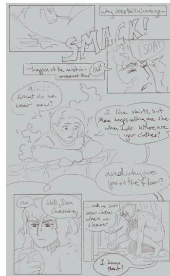
Figures 1 and 2: Fully realized sketches from “Phase”, a two page spread and one page respectively.