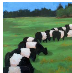
THE HERD Acrylic on board 8 x 8" $350