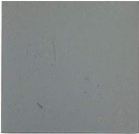
CROWTOWN, 2018 Oil on linen 30 x 30 1/2" $4,500