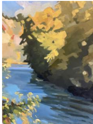
RIVERSIDE Oil on canvas 24 x 18" $2200