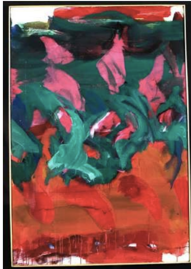
FLUTE BIRD SONOGRAM, 1983 Acrylic on kraft paper 51 x 35" framed $2000