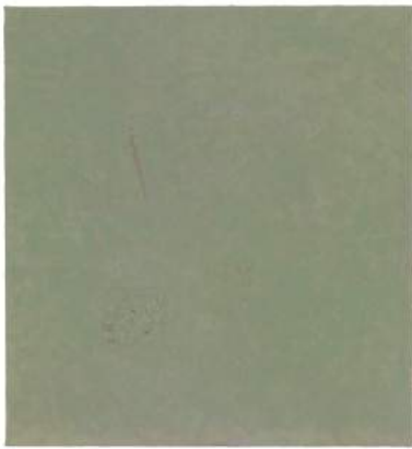
RIVER (JOSIAS), 2017 Oil on linen 20 x 18 1/2" $3,400