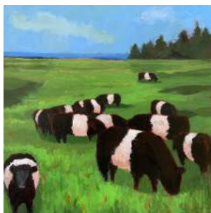
COWS BY THE SEA Acrylic on board 8 x 8" $350