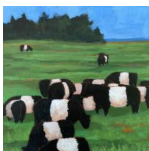
FIELD OF BELTIES Acrylic on board 8 x 8" $350