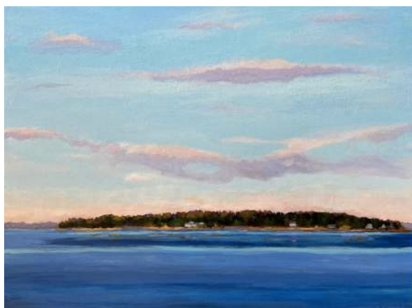
ISLAND DELIGHT Acrylic on board 18 x 24" $750