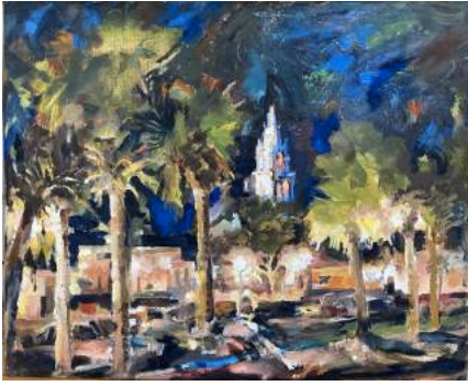
ROLLINS COLLEGE CHAPEL AT NIGHT, 2017 Oil on thick paper 20 x 24" $1,200