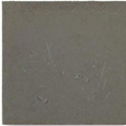
EARTH (COAT), 2018 Oil on linen 23 3/4 x 24" $3,500