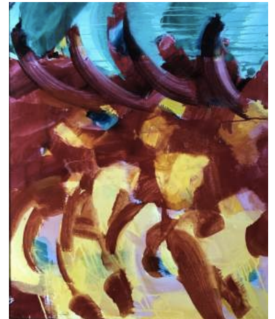
UNTITLED ABSTRACT, 1983 Acrylic on kraft paper 31 x 25" $1,000