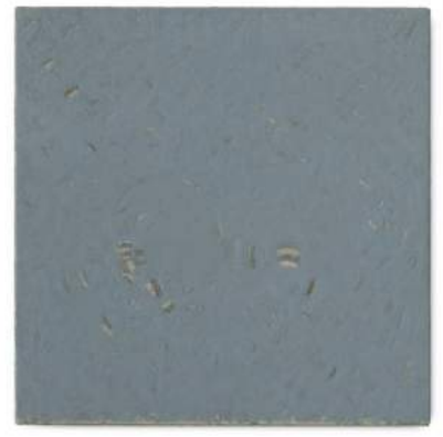
OVER / UNDER, 2016 Oil on linen 16 x 16" $2,000