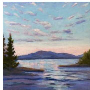
PURPLE TWILIGHT Acrylic on board 12 x 12" $500 SOLD