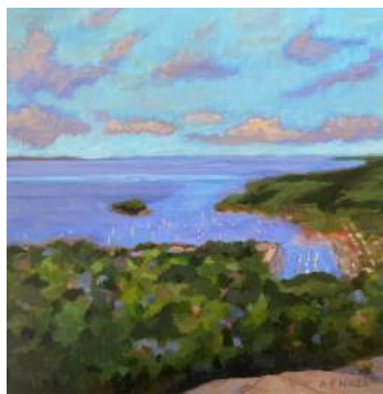
VIEW OVER CAMDEN HARBOR Acrylic on board 12 x 12" $500