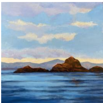
PULPIT ROCK Acrylic on board 12 x 12" $500