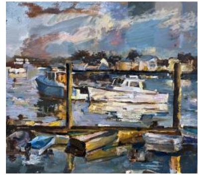
FISHING BOATS, RYE HARBOR, 2017 Oil on canvas 21 x 23" framed $800