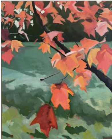
MAINE MAPLE Oil on canvas 30 x 24" $3200