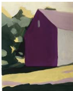
HILLSIDE BARN Oil on panel 12 x 12" $800