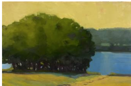
LOOKING ACROSS Oil on panel 12 x 18" $1600