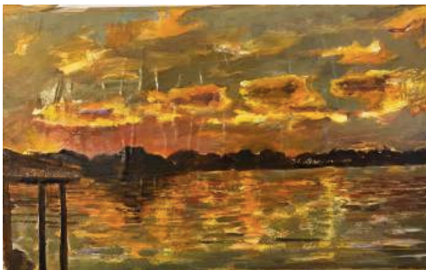
FOUR BROTHERS, 2000 Oil on paper 14 x 22" $800