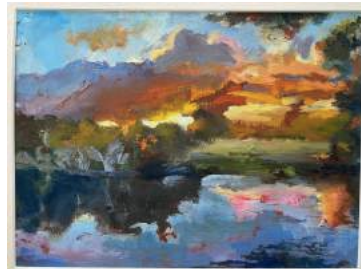
TOMOKA SUNSET, 2017 Oil on canvas 13 x 17" framed $600