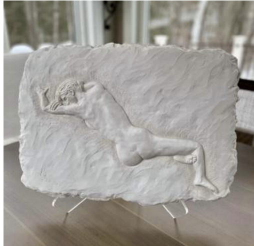
RECLINING NUDE IN RELIEF Sculpted in clay; Cast in plaster 21 x 16" $900 (includes acrylic stand)