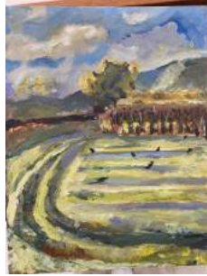
NEWLY MOWN HAYFIELD, 2000 Oil on mat board panel 14 x 11" edges painted $450