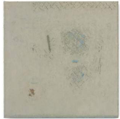
BAY, 2018 Oil on linen 24 1/4 x 24" $3,250