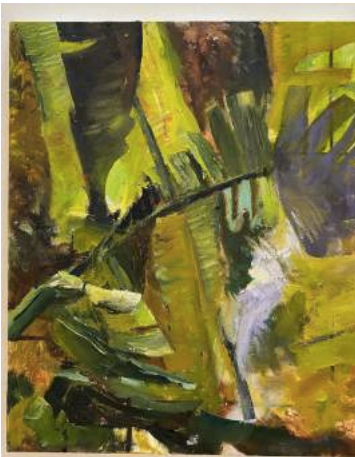
BANANA PALM, 2020 Oil on canvas 27 x 22" edges painted $1,200