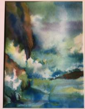
BLACK HEAD II