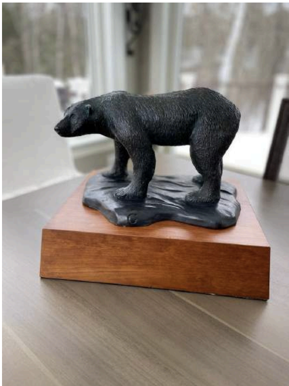
POLAR BEAR Sculpted in oil based clay; Cast in bronze 12 x 10 x 8.5" (base: 14.5 x 11.5 x 3.5") $3,200