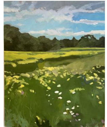
MOSTLY BUTTERCUPS Oil on canvas 30 x 24" $3200