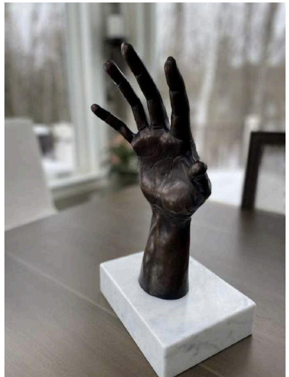
MY RIGHT HAND Sculpted in oil based clay; Cast in bronze 13 x 8 x 4" (marble base: 8 x 6 x 2") $1,800