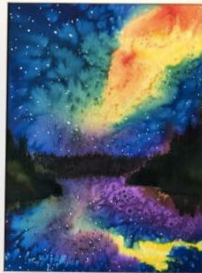
NIGHT SKY II