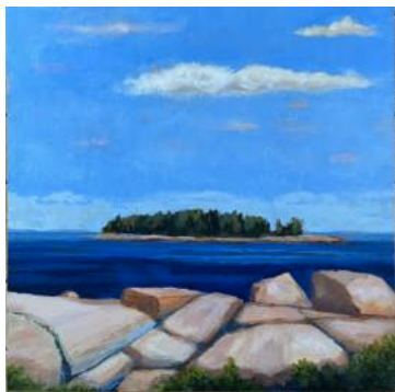
ROCKY COAST Acrylic on board 12 x 12" $500