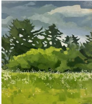
PLEASE DON'T EAT THE DAISIES Oil on canvas 28 x 25" $3200