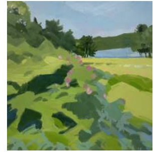
SEA ROSES Oil on panel 12 x 12" $800