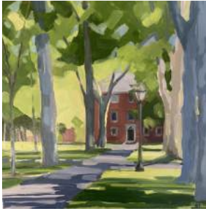
A WALK ON CAMPUS Oil on panel 12 x 12" $800