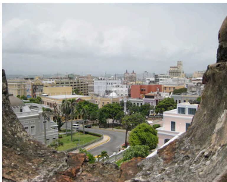
View of San Juan from San Cristóbal Fort, Puerto Rico