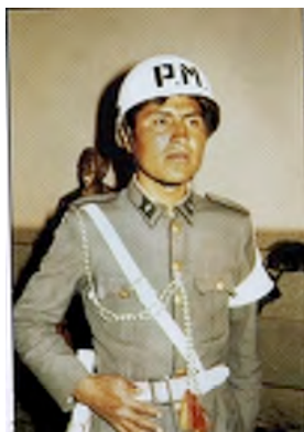
Evo Morales during his military service.

working on model farms, cutting sugar cane, constructing drainage systems, digging wells, and building roads. I also draw from novels and memoirs written by indigenous activists, military officers, and Chaco War veterans.