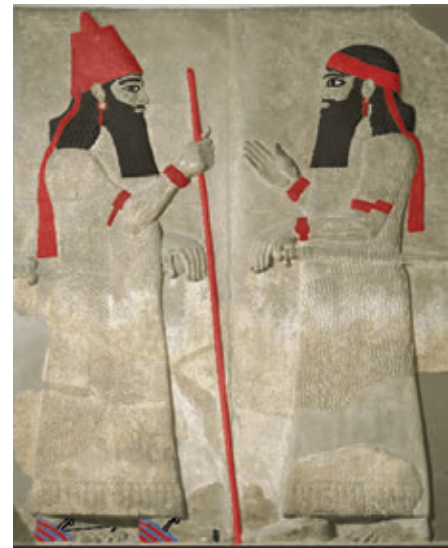
Digital re-colorations of a relief from the exterior of the palace of Sargon II at Khorsabad, (© Li Sou & the Trustees of the British Museum).

The image on the left is one rendition of how the inside of the palace might have appeared during the reign of King Ashurnasirpal II. This interpretation also includes painted murals that were in the palace and that may have included more colors than the reliefs. To the right is another interpretation of color placement on the reliefs. The truth is, we don't know exactly what the original reliefs looked like; it's something scientists and historians still debate today.