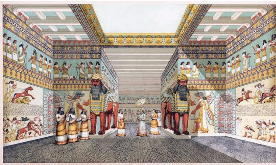
Austen Henry Layard. ca. 1849. Northwest Palace

Why do you think there is so little color remaining on the surfaces?