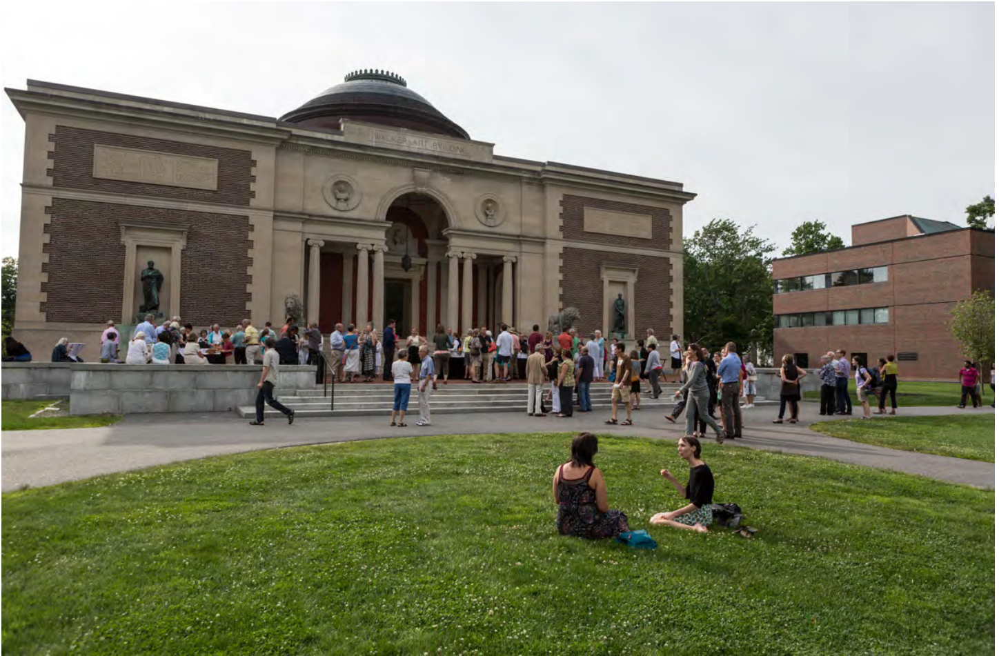
Visitors at opening day for Richard Tuttle: A Print Retrospective , June 28, 2014