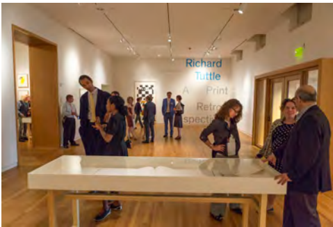
Opening reception for Richard Tuttle: A Print Retrospective , June 2014

“It is the most exciting and important exhibition of contemporary art to have been mounted in Maine in many years. It is also particularly relevant for Maine’s art communities because Tuttle aligns himself perfectly with the craft-friendly, concept-driven art that comprises the most significant thread of contemporary art-making in the state.”