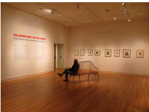
A visitor enjoys Collaborations and Collusions. , fall 2014