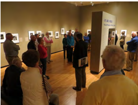
Thursday Night Salon: On 52nd Street , July 2014