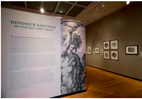
Installation view of Hendrick Goltzius: Mythology and Truth .