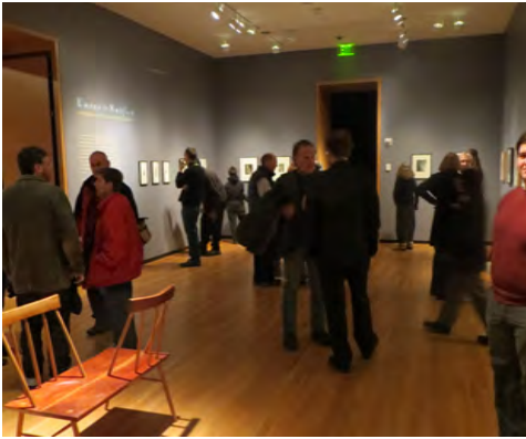
Opening reception for Under the Surface: Surrealist Photography , February 2014