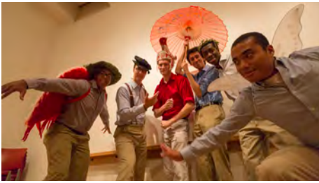
Participants at the "photo booth" during the student fall reception, September 2014