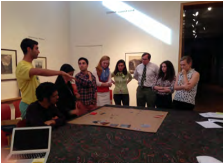
Students assist with exhibition design, spring 2014