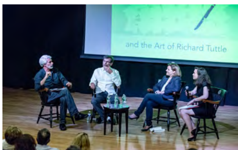
"Prints, Textiles, and the Art of Richard Tuttle" on June 28, 2014