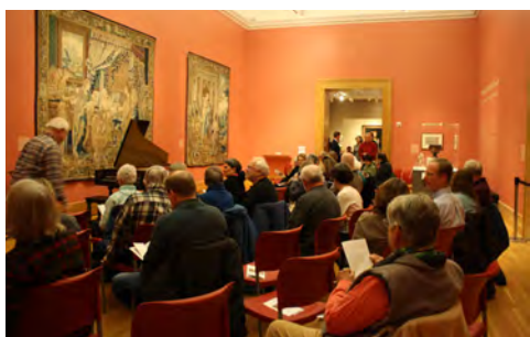
Patrons gather for Baroque chamber music in the Weaving the Myth of Psyche exhibition in December 2014.