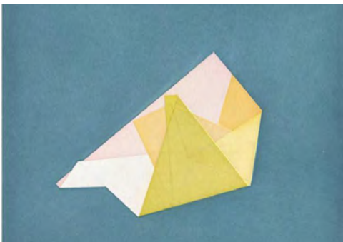
Alyson Shotz, Sequent , 2013, (detail) color aquatint and collograph with embossing. Museum Purchase, Greenacres Acquisition Fund.