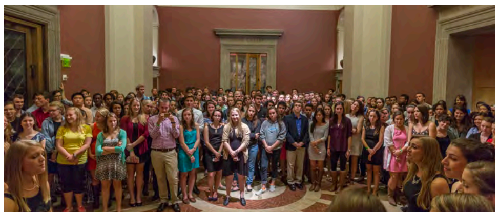
Students in the Rotunda for a musical performance during the student reception, September 2014