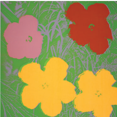
Flowers , 1970, screen print by Andy Warhol.