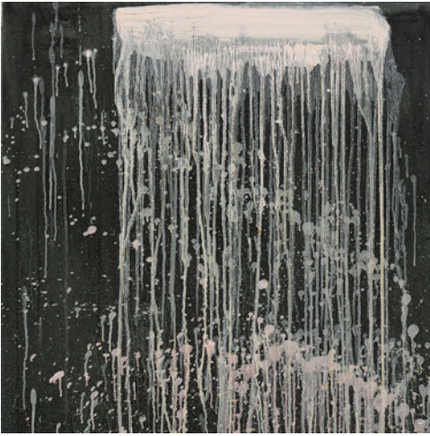
Small White Waterfall with Pink Splashes , 1995, oil on canvas by Pat Steir. Herbert and Dorothy Vogel Collection.