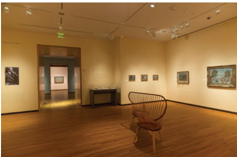
Maurice Prendergast: By the Sea