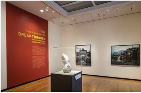
Breakthrough: Work by Contemporary Chinese Women Artists