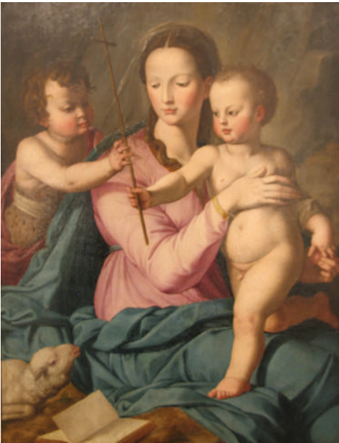
Virgin and Child , oil painting by Studio of Bronzino.