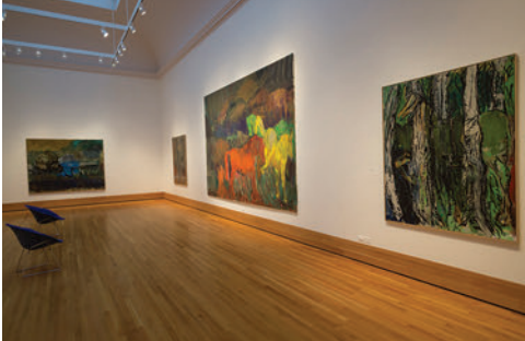
Per Kirkeby: Paintings and Sculpture

– Portland Press Herald , January 13, 2013