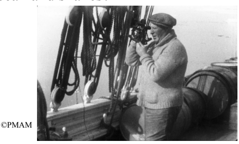
A. A nervous wreck!

What sits on the bottom of the cold Arctic Ocean and shakes?