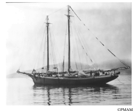
The Effie M. Morrissey