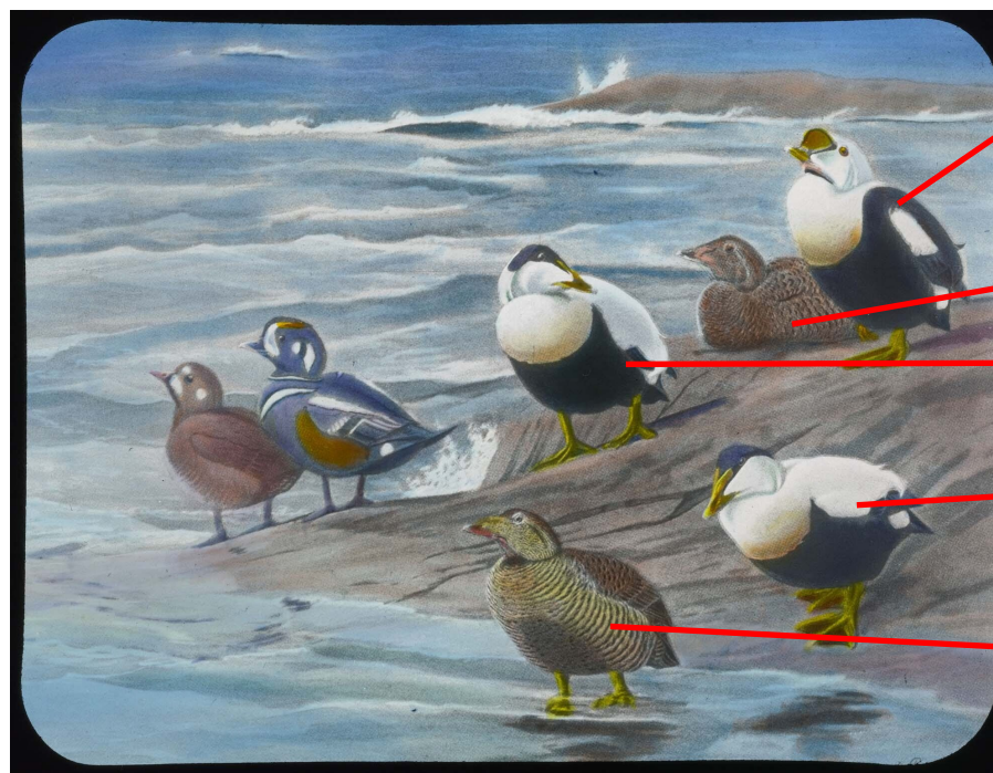
Fuertes, Louis Agassiz, King Eider, Northern Eider, Harlequin Duck, Eider , 1925. Silver gelatin, pigment on glass. Gift of Donald and Miriam MacMillan.

The female Eider lines her nest with downy feathers from her own breast to keep her eggs warm. When the ducklings hatch they are gathered into large groups or "crèches." Adult duck "babysitters" can look after 100 ducklings or more in a single crèche.