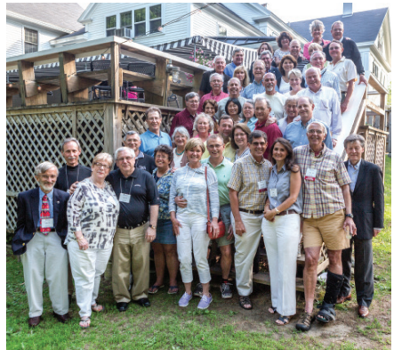
Members of the Class of 1970 and spouses at their 45th Reunion.