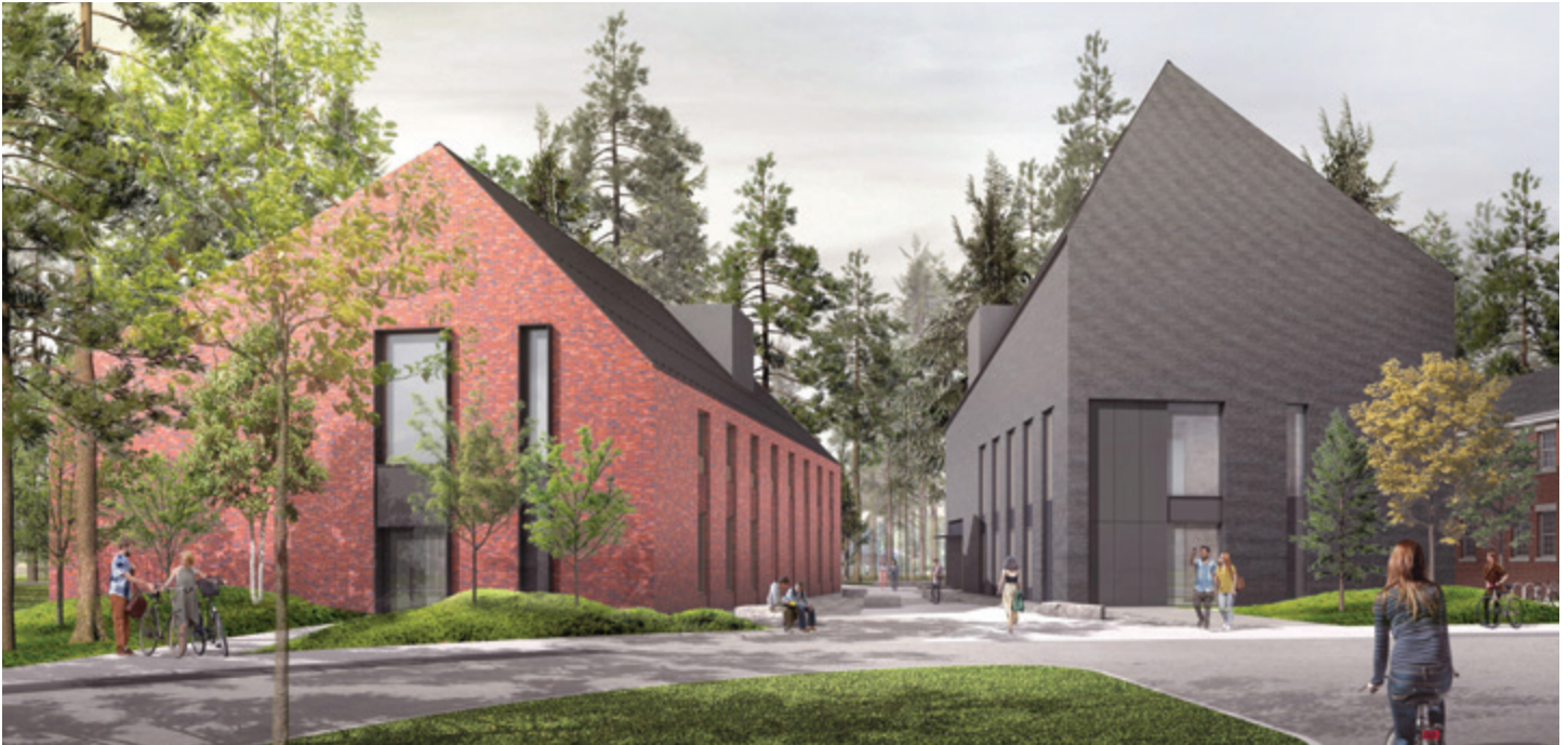
Rendering of Barry Mills Hall and the John and Lile Gibbons Center for Arctic Studies.