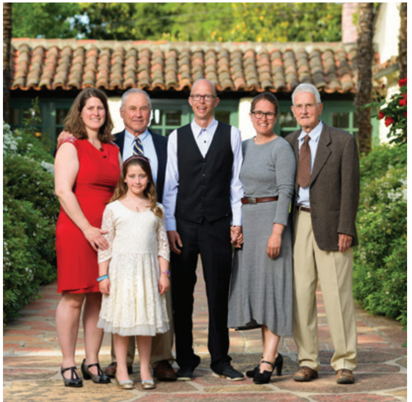
The Pfeiffer family