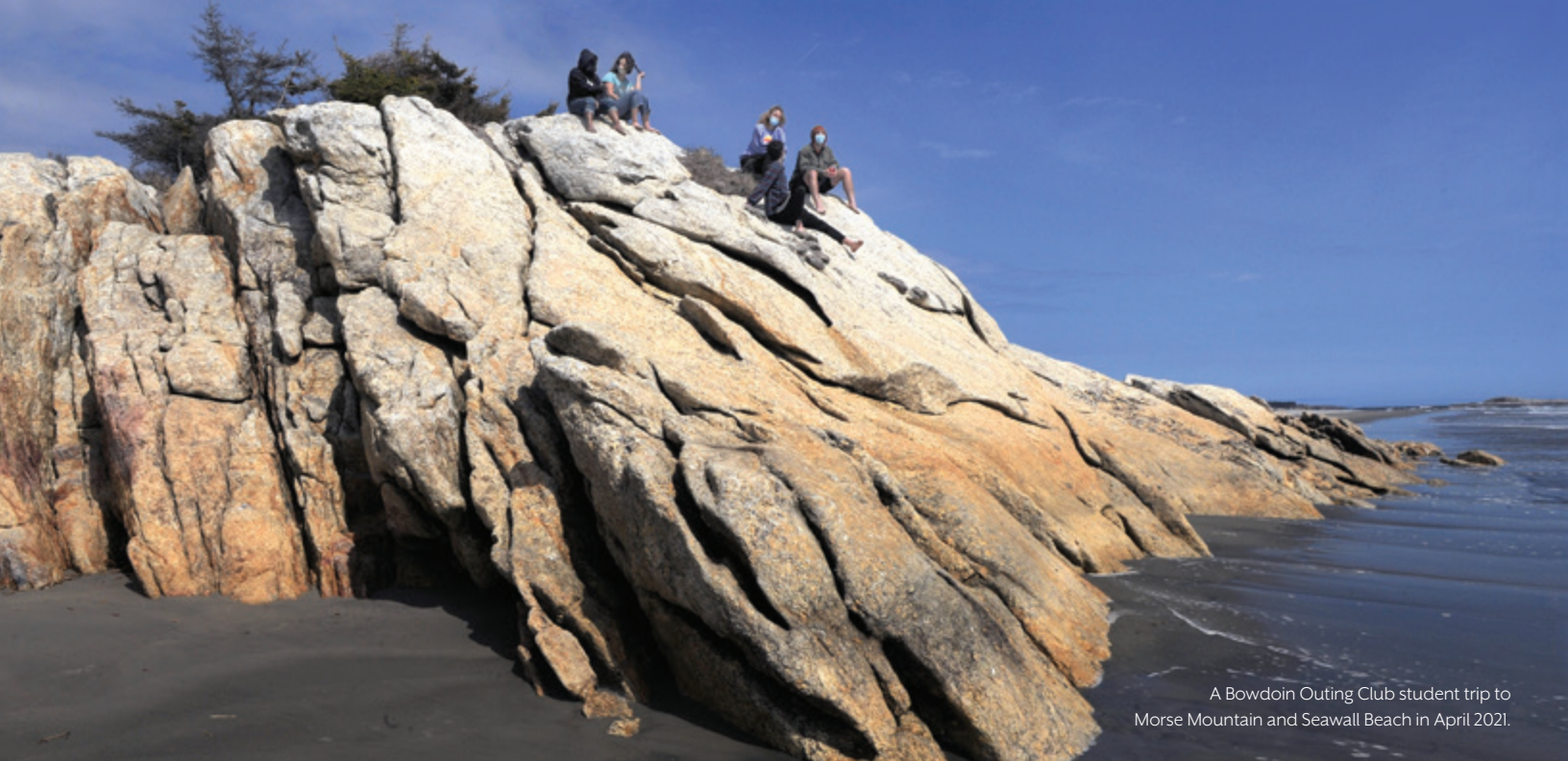
A Bowdoin Outing Club student trip to Morse Mountain and Seawall Beach in April 2021.

Stories, Updates, and Opportunities that Shape the Campaign for Bowdoin