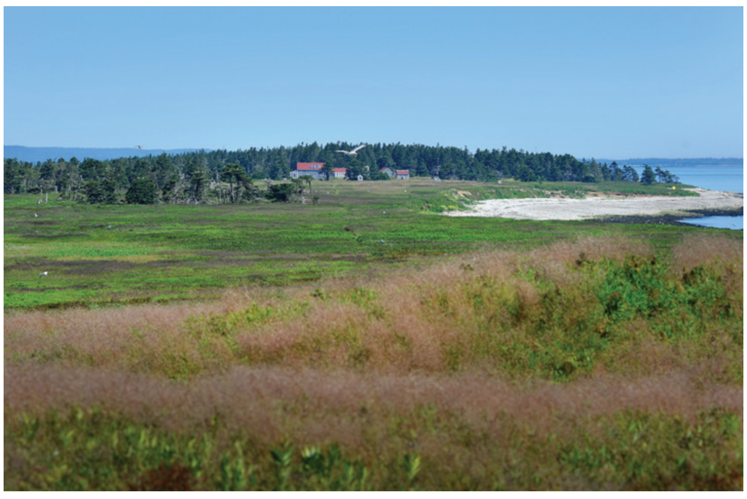
The Bowdoin Scientific Station on Kent Island is located just south of the island of Grand Manan in the Bay of Fundy in New Brunswick, Canada.