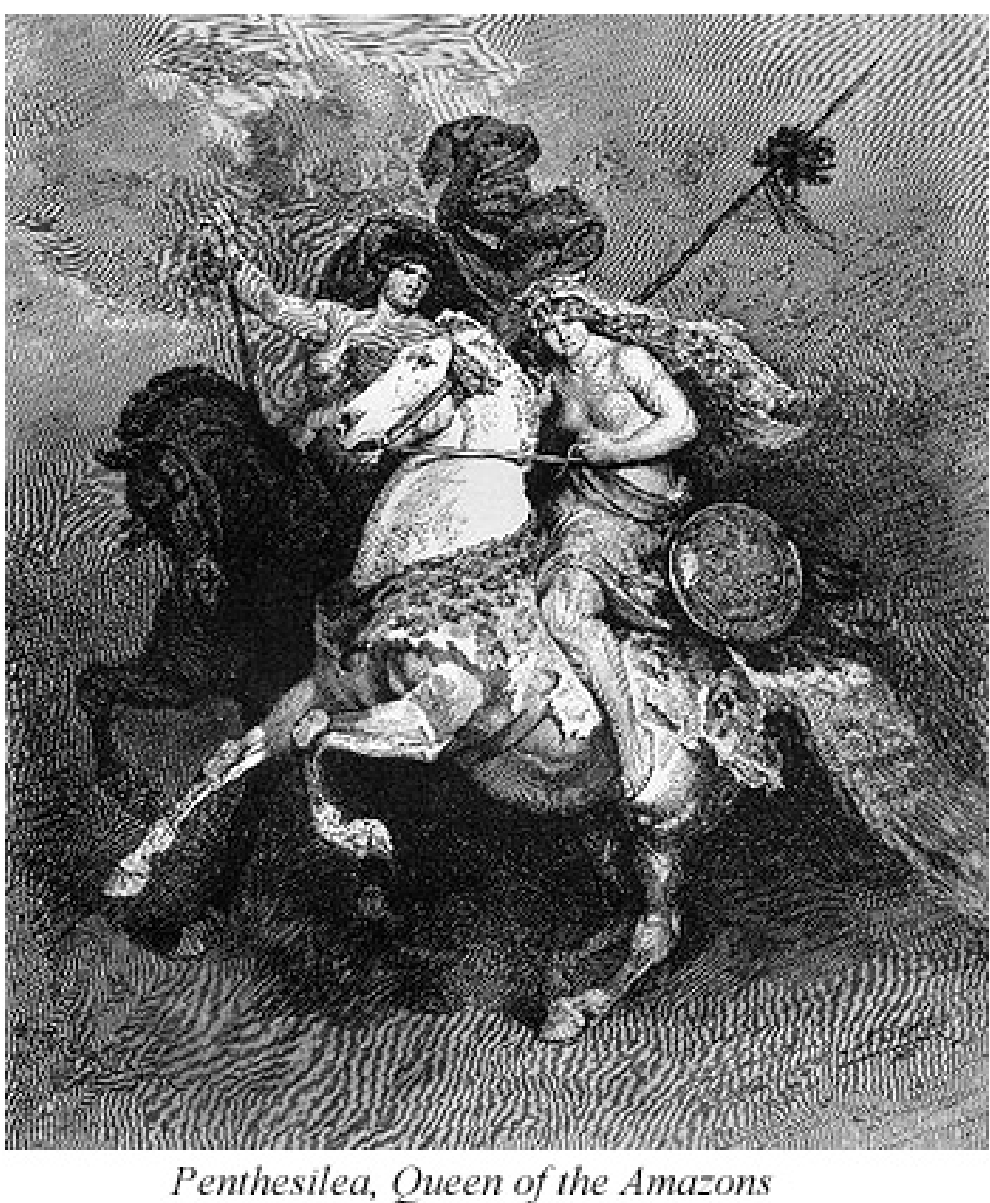
Wood engraving. 1892 print.

In real life, women horse archers existed in a number of societies over a 1000 year period and in a broad 4000 mile arc from the Don Basin to China including the territories along the Black Sea, the Sea of Azov, the Caucasus Mountains, the Caspian Sea and the broad flowing steppes to northwest China