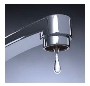
But they leak!