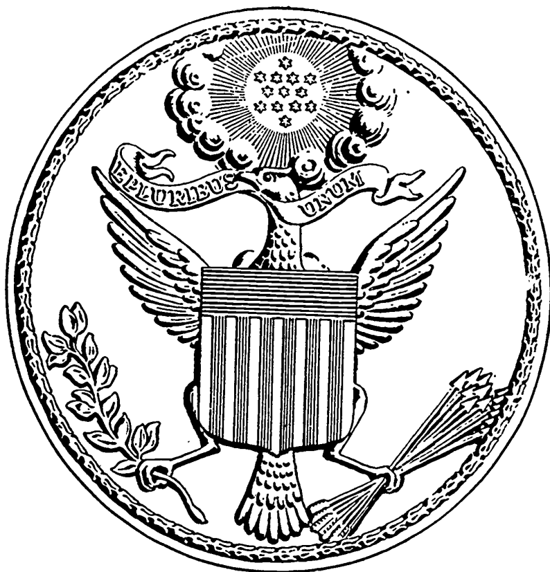
The first Seal of the United States, 1782.

agreed that these institutions were flawed, the authors of The Federalist * held that the causes of human quarrelling could not be blamed simply on external conditions. The roots of discord and faction are "sown in the nature of man" (No. 10). Thus, in answer to the question, "Why has government been instituted at all?" Publius replied: "Because the passions of man will not conform to the dictates of reason and justice without restraint" (No. 15). Since no arrangement of the social order could ever make men good, government, with its ultimate threat of coercion, would always be necessary.