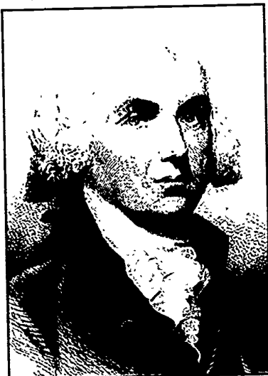
James Madison.