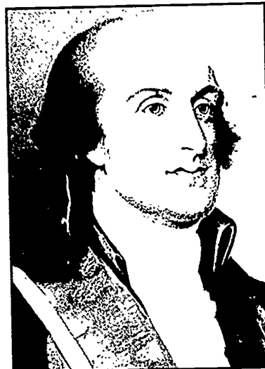
John Jay.

ern democratic passion par excellence . Publius does not condemn any of these selfish impulses, or even try to moderate them. For The Federalist is confident that improvements and discoveries in "the new science of politics" (No. 9) will enable them to channel these desires toward the public good.