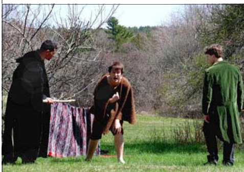
Theatre and Dance students perform “The Tempest” at the CSC in May 2005