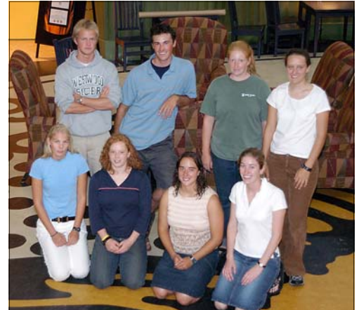
Coastal Studies Summer Fellows presenting the results of the research at a poster session in Smith Union