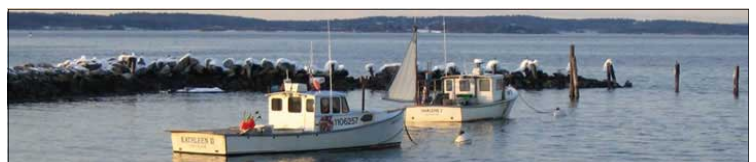
Lobster boat moored off Long Island in Casco Bay, March 2005