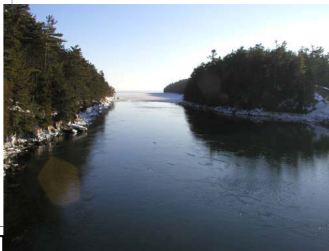
Looking south down “The Gurnet” adjacent Lumbos Hole, Harpswell Sound