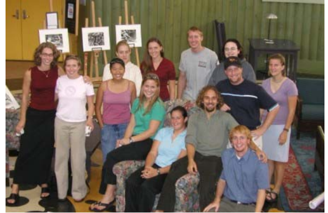
2003 summer fellows at poster presentation in Morrell Lounge, Smith Union in September, 2003.