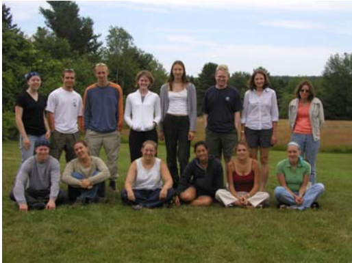
CSC summer fellows and research assistants

axis of the property were laid. This survey will help complete high resolution GIS mapping and will be used by a variety of courses and projects in Geology, Environmental Studies and Biology.