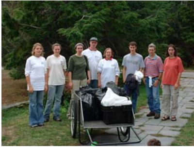
Coastal clean up volunteers Sept., 2001

The CSC was involved with several projects over the year to increase our level of community service and public education about important coastal issues. In the fall, Bowdoin faculty, staff and students participated in coastal clean-up efforts at the CSC as part of the largest volunteer effort in the state of Maine. Faculty, staff and students participated in this effort which also coincided with Bowdoin's Common Good Day on Saturday, September 29, 2002. The CSC clean-up teams recorded the type and amount of the debris collected. The data are quantified by the state and help pinpoint the sources of marine debris and develop solutions for preventing debris like nets and six-pack rings from entangling marine mammals.