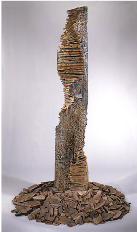
El Anatsui b. 1944 Anyako, Ghana Erosion 1992 Wood, paint, wood chips, sawdust H. 268 cm (105 1/2 in.) 96-36-1, museum purchase

Artists in Africa and beyond, do not simply document transformations to their environment as passive observers, they are agents of change, often building awareness and provoking thought through their work and process. Take the words of Nigerian painter Jerry Buhari: "Today the talk of the world is about an endangered Earth. One often wonders how much of the talk is backed with genuine concern and the will to take positive steps. But it should not surprise the world that artists are in the forefront of the discussion on the environment. They have always been." How to care for a community surrounded by exposed asbestos; considering what becomes of the TVs, iPhones, and computers that get thrown away; and talking about the impact of war on land and animals-these are among the issues Africa's artists have tackled in the past two decades. But maintaining a healthy environment, climate and ecosystem have been of long-standing concern for artists and communities across the African continent.