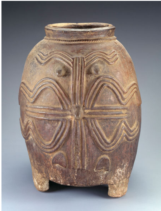
Kurumba artist, Burkina Faso Storage vessel, Mid-20 th century Ceramic National Museum of African Art, gift of Saul Bellow, 81-10-1

Across the vast African continent, artists have found inspiration in the earth's mud, pigments, plants, stone, ash, and incredibly diverse resources. These materials have been used to express personal or cultural identity, provide connections to the generations who have walked the land before us, build fantastic structures, and imagine what we have lost to time. The ideas and arts inspired by the earth are as diverse as the materials this planet and its land provide.